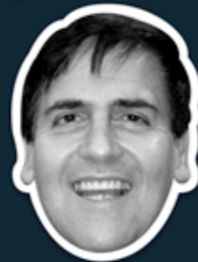
MARK CUBAN CO-FOUNDER, HDNET